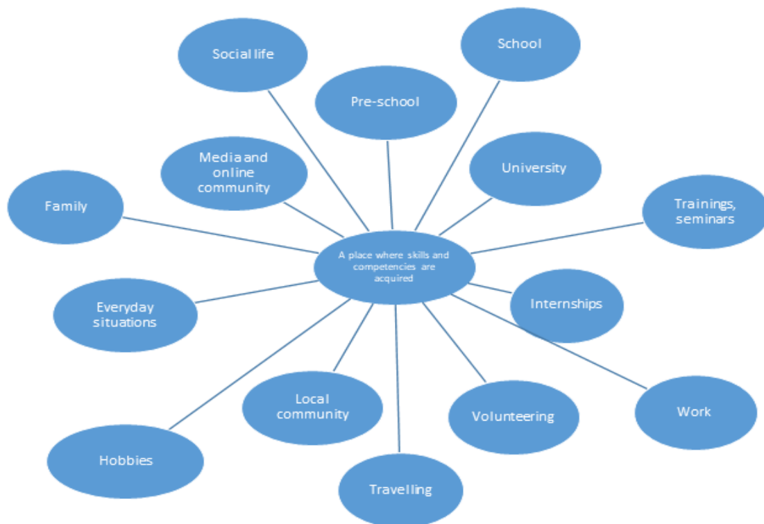
Figure 1. Map on how/where to acquire skills

“As the situation changes radically in the 21 st century, we as humanity are entering a crisis, which in both, social and personal life, means one simple thing – a situation for which we do not have pre-prepared solutions. Creating new, unconventional, unprepared solutions to a new challenge requires creativity that has to be encouraged.”